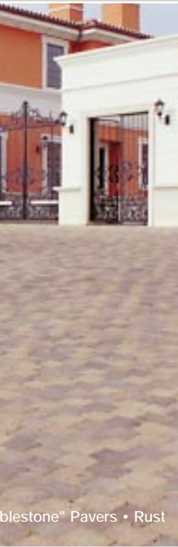
"Cobblestone" Pavers • Rust