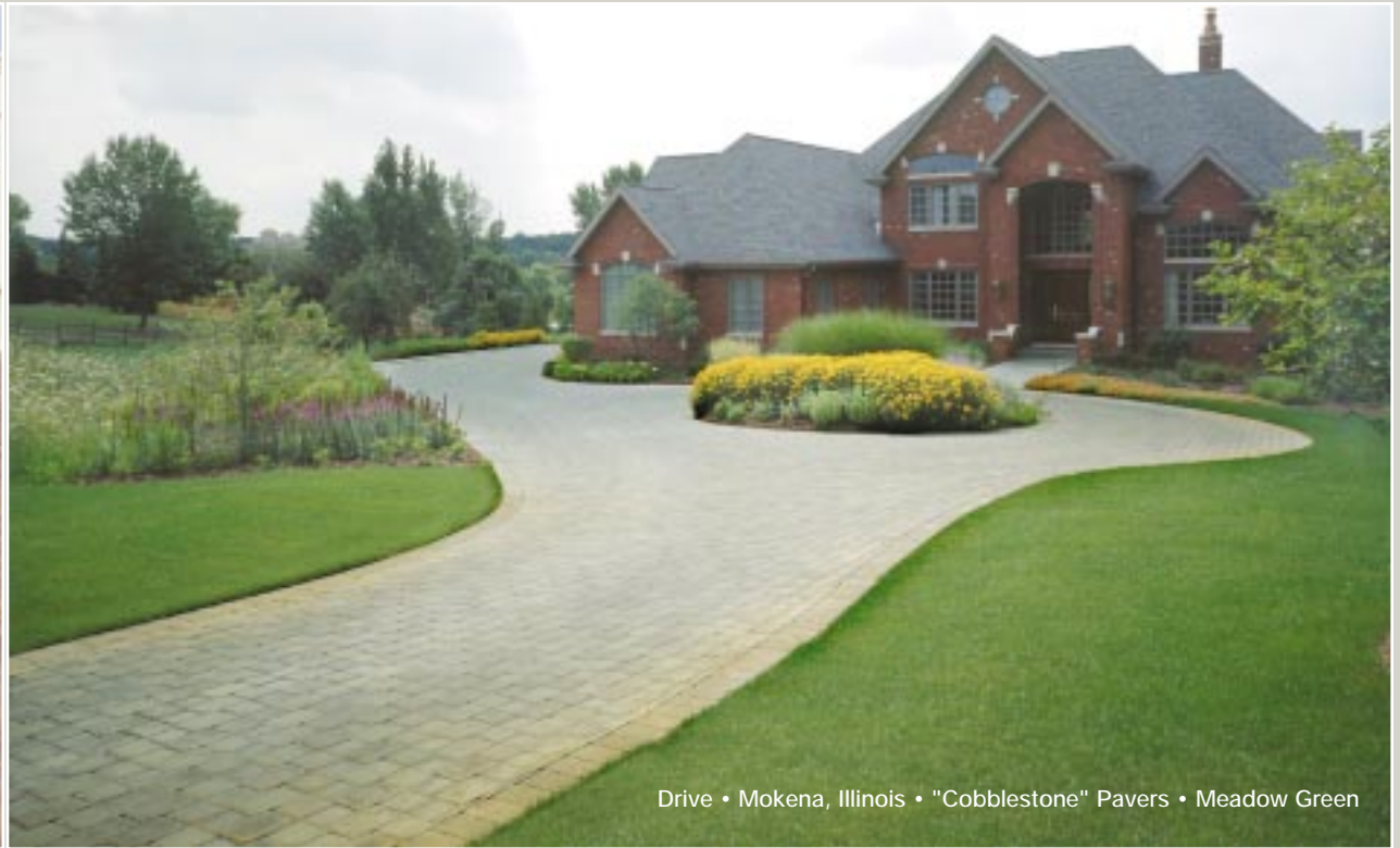
Drive • Mokena, Illinois • "Cobblestone" Pavers • Meadow Green