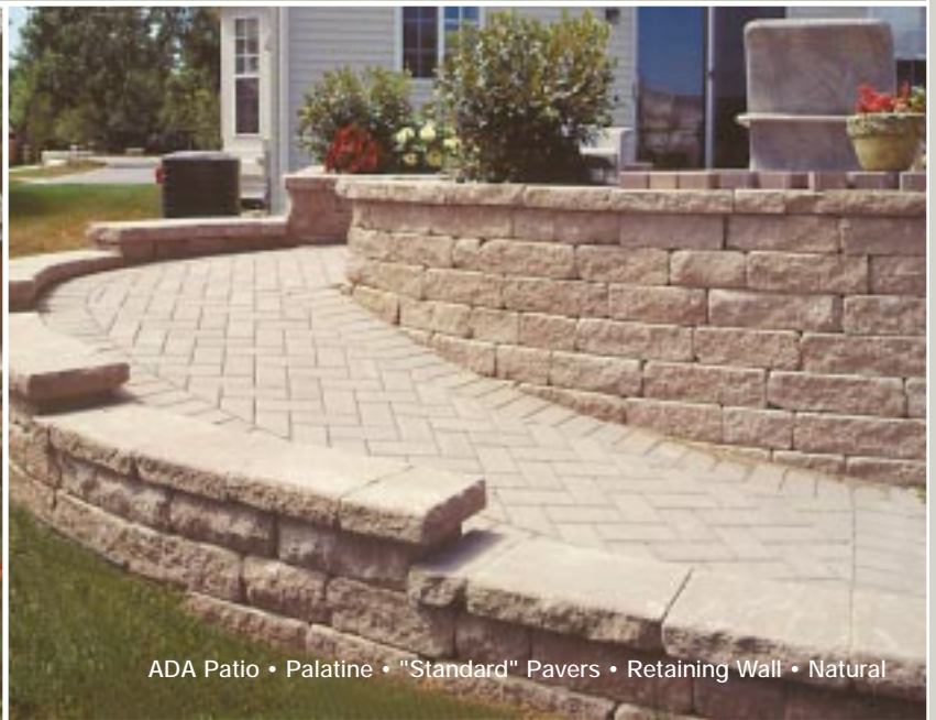
ADA Patio • Palatine • "Standard" Pavers • Retaining Wall • Natural