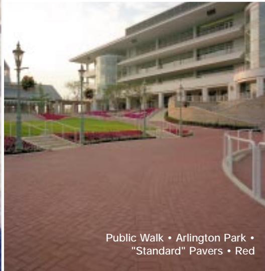
Public Walk • Arlington Park • "Standard" Pavers • Red

Paver Construction 1819 N. Wilke Road Arlington Heights, IL 60004 Phone: 847-398-1830 Fax: 847-398-1882 Email: PavCon1819@email.msn.com Website: www.paverconstruction.com