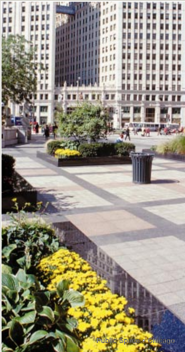
Public Space • Chicago