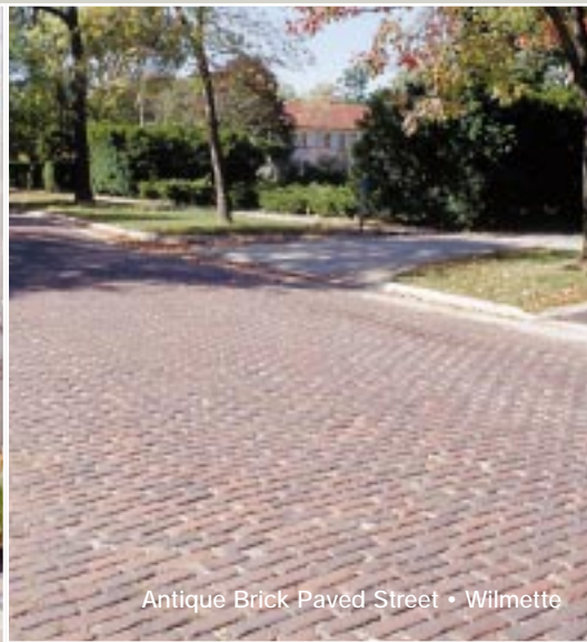
Antique Brick Paved Street • Wilmette