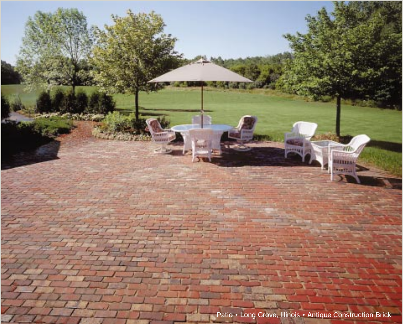
Patio • Long Grove, Illinois • Antique Construction Brick

Residential • Commercial • Public Quality Since 1983